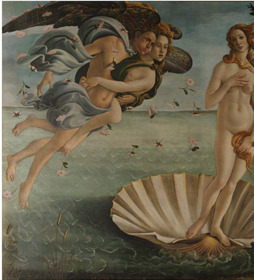
The Birth of Venus

3. Create a new gallery. To create a new gallery and start adding images you favorited, click the menu icon at the top left (three lines button), then choose “Favorites.” On the favorites page click “Create New Gallery.” Click