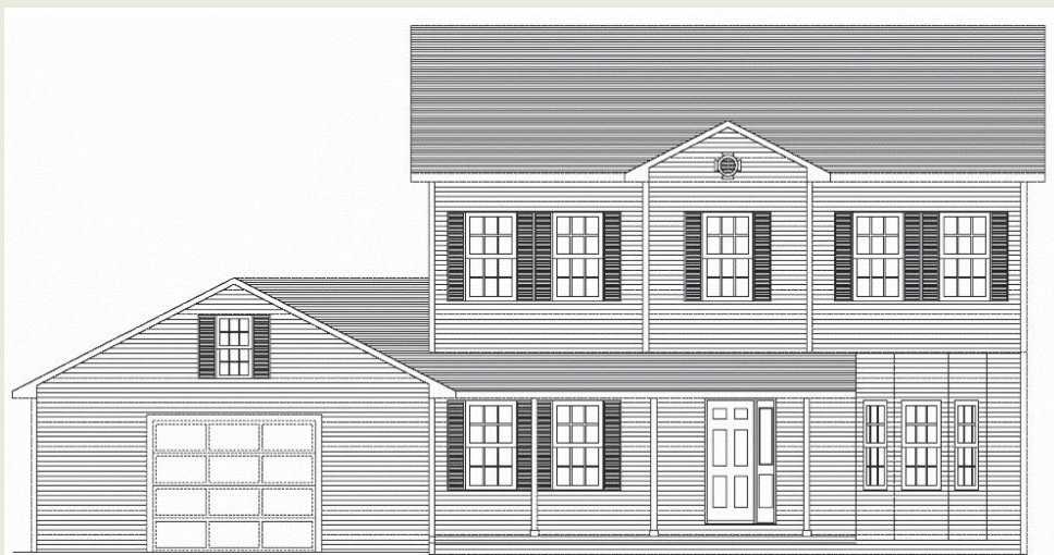
Figure 1. Traditional style elevation blueprint drawing

There are two types of blueprint drawings that are used in the construction industry that correlate to the theoretical framework of the dissertation. First, an architect must create an elevation drawing to display the exterior of the home. This drawing offers an outside view of the style and structure, as shown in Figure 1.