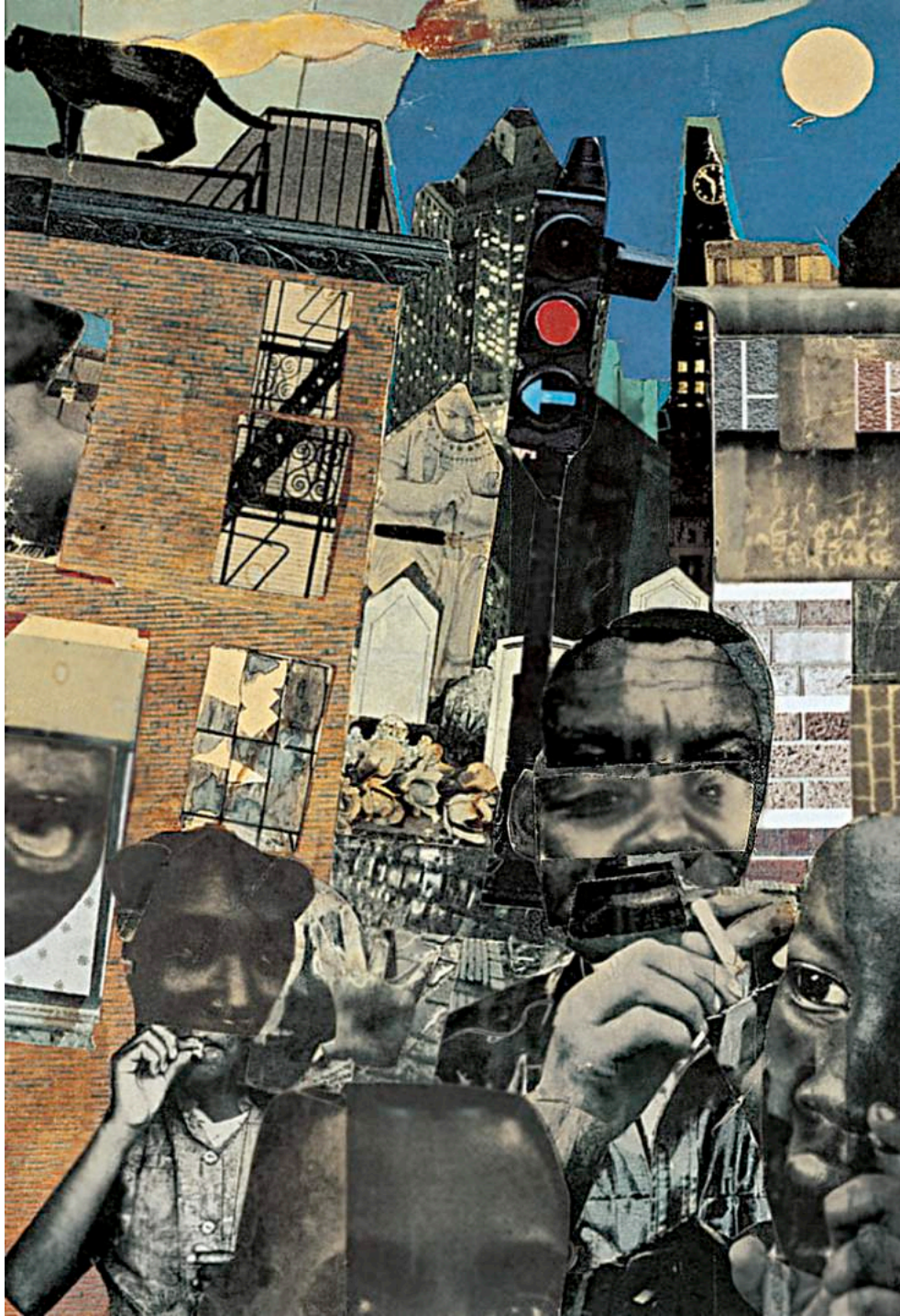
Section 1, image 1: