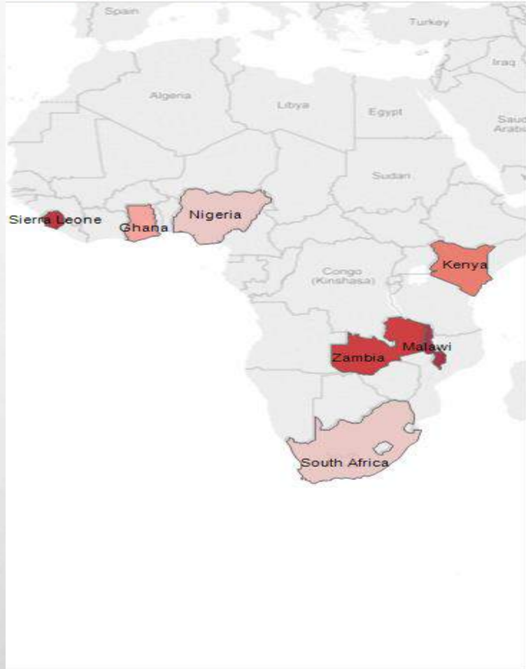
Map based on Longitude (generated) and Latitude (generated). Color shows sum of Poverty Headcount Ratio. The marks are labeled by Country Name. Details are shown for Country Name. The view is filtered on Country Name, which keeps 7 of 14 members.