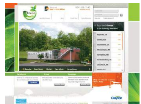
FIGURE 5.11 The Clayton i-house: “A Giant Leap from the Trailer Park”