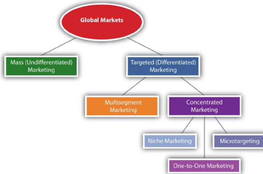
FIGURE 5.9 Targeting Strategies Used in Global Markets

Most companies, however, tailor their offerings to some extent to meet the needs of different buyers around the world. For example, Mattel sells Barbie dolls all around the world—but not the same Barbie. Mattel has created thousands of different Barbie offerings designed to appeal to all kinds of people in different countries.