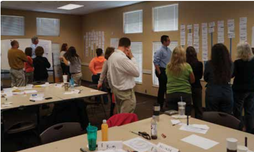
One of the 480 storyboard sessions held with Ottawa County employees.