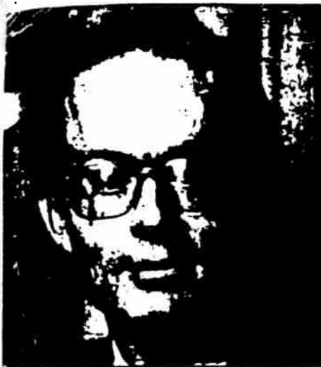
Goldman's Black: All roads lead to Black-Scholes

Investment bankers—and their corporate clients—have depended on net present value analysis for decades. The belief held by some academics that net present value analysis is flawed has propelled research into CCA. In particular, some academics argue that discounted cash flow techniques systematically undervalue projects. NPV analysis is missing options embedded in the projects, according to these academics.